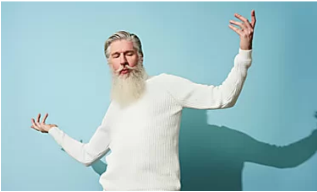
If You Can Qualify for Any Credit Card, These Are the Top 6 NerdWallet