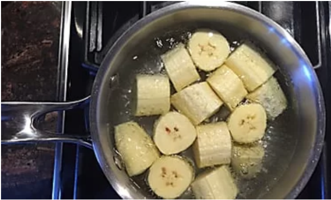
Diet Expert Tells All: "It's Like A Powerwash For Your Insides" Gundry MD