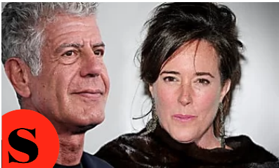
S Clicks over ethics: Mainstream media's coverage of suicide is... Salon.com