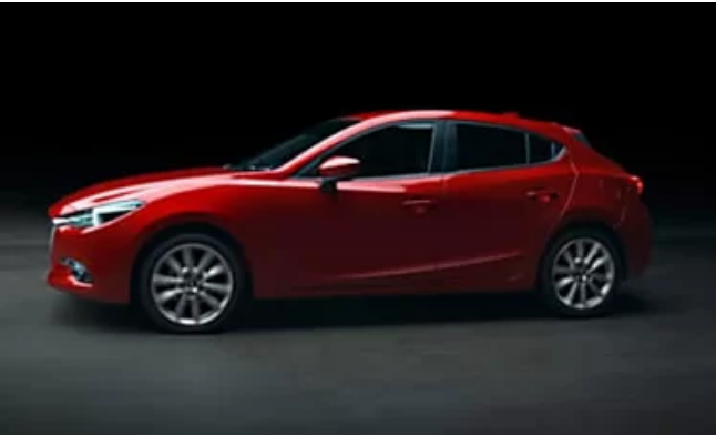
8 Cars So Cool It's Hard to Believe They Cost Under $20k Faqeo