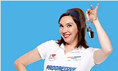
Drivers who switch to Progressive save an average of $668 Progressive