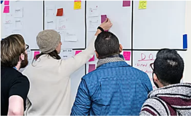
Engineers: Here's a Look at Carbon Black's Agile Transformation Carbon Black