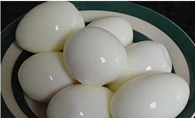
Constant Fatigue Is A Warning Sign - See The Simple Fix Health Headlines