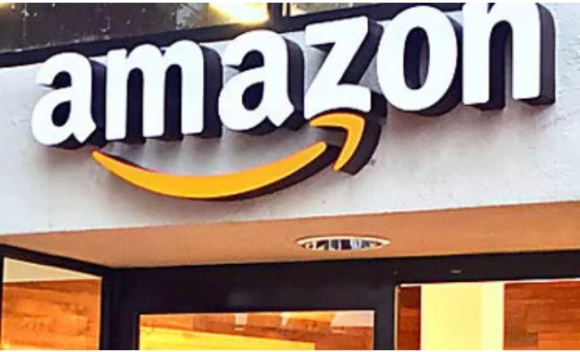
This Amazon Upgrade Is Even Better Than Prime Honey