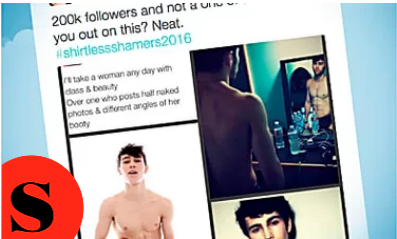
S "Never date a girl who posts half naked slutty selfies": Revel in the... Salon.com