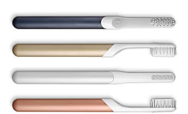
Discover Why quip Was Named In TIME's Best Inventions of 2016. www.getquip.com