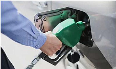
Now You Know: Why Fuel Doors Are on Different Sides of Cars Allstate