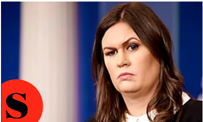
S "You reap what you sow": Historian Jon Meacham says Trump staff should... Salon.com